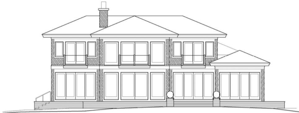
Lake Charlevoix Residence

In partnership with Indesign of Charlevoix, Mr. Bates was the designer of 2,000 sq. ft. of additions to an existing 2,250 sq. ft. single family residence within steps of Torch Lake. The main three-story addition included bedrooms on the lower level, an office, garage and entrance on the middle level, and an office on the third and tower level. Construction has begun and will be completed in the spring of 2014.