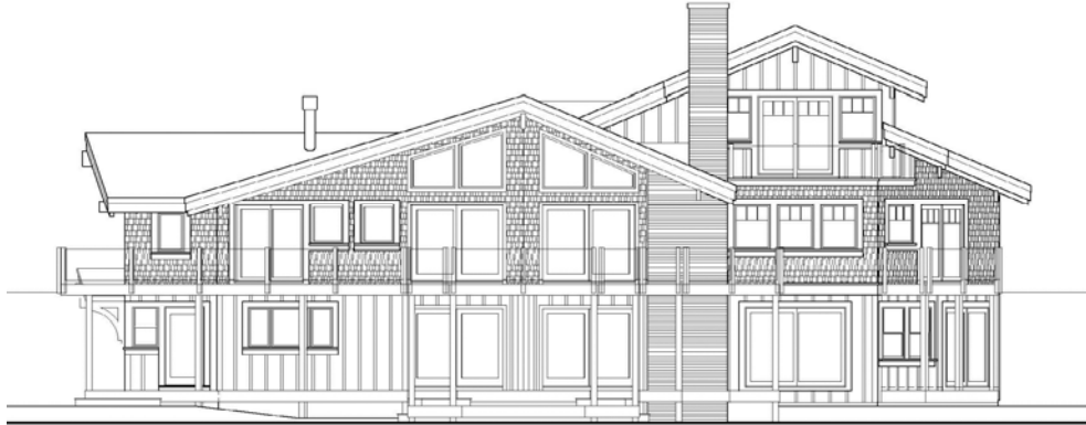
Torch Lake Addition

In partnership with Indesign of Charlevoix, Mr. Bates was the designer of 2,000 sq. ft. of additions to an existing 2,250 sq. ft. single family residence within steps of Torch Lake. The main three-story addition included bedrooms on the lower level, an office, garage and entrance on the middle level, and an office on the third and tower level. Construction has begun and will be completed in the spring of 2014.